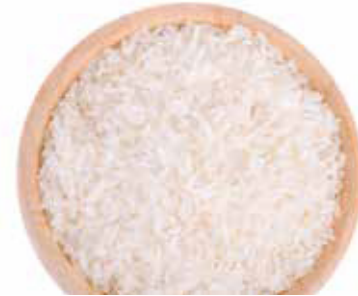
RICE: JASMINE DISTINCTIONS Item #21262 Pack: 1/20 lbs. HFS 166406