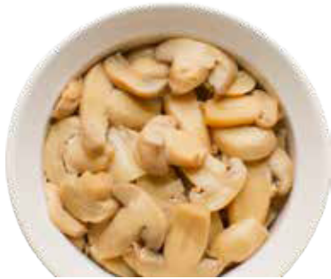
MUSHROOM: PIECES & STEMS GRADE A