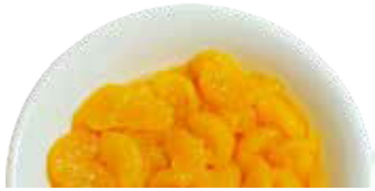
MANDARIN ORANGES: BROKEN SEGMENTS