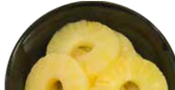
PINEAPPLE: SLICED IN JUICE