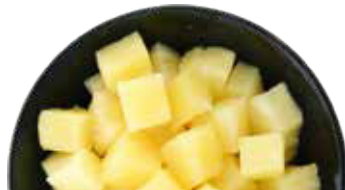
PINEAPPLE: CHUNK IN JUICE