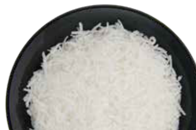
COCONUT: SHREDDED SWEETENED FANCY DISTINCTIONS Item #17946 Pack: 5/2 lbs. HFS 372637