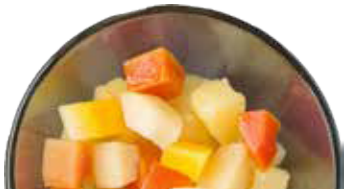
FRUIT SALAD: TROPICAL IN LIGHT SYRUP WITH PASSION FRUIT JUICE