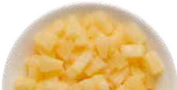
PINEAPPLE: TIDBIT IN JUICE