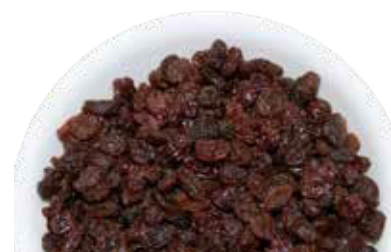
RAISINS: SEEDLESS, SELECT ORIGINALS Item #18142 Pack: 12/2 lbs. HFS 371285