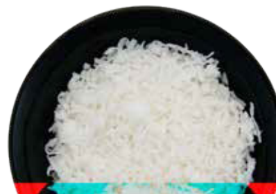
COCONUT: FLAKE SWEETENED FANCY DISTINCTIONS Item #17948 Pack: 5/2 lbs. HFS 371649

Bountiful Harvest raisins and dry coconut are the perfect topping for creamy desserts like rice puddings.