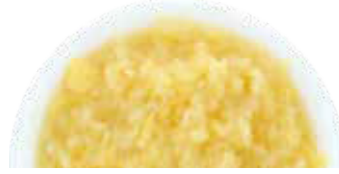
PINEAPPLE: CRUSHED IN JUICE