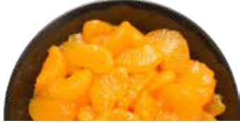
MANDARIN ORANGES: WHOLE SEGMENTS