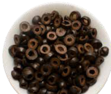
OLIVES: RIPE, SLICED