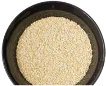
QUINOA: WHITE PRE-WASHED ORIGINALS Item #20070 Pack: 2/5 lbs. HFS 773739