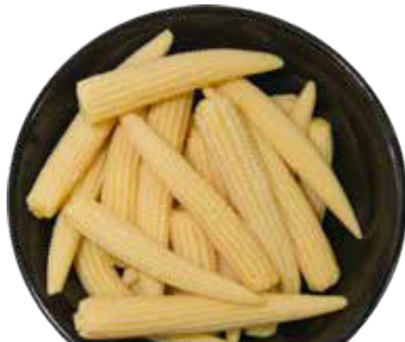
BABY CORN: WHOLE 150 COUNT