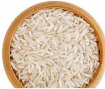
RICE: BASMATI DISTINCTIONS Item #21261 Pack: 1/10 lbs. HFS 210073